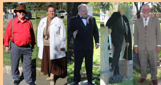
October 2016 Historic Cemetery Tour