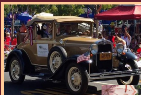
July 2016 Independence Day Parade

Go to www.ontariocitylibrary.org for details and rules | #HeritageattheSquare